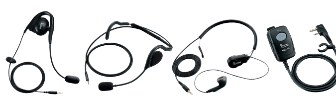
▲ HS-94 ▲ HS-95 ▲ HS-97 ▲ VS-1L

HS-94 : Earhook headset with flexible boom microphone.