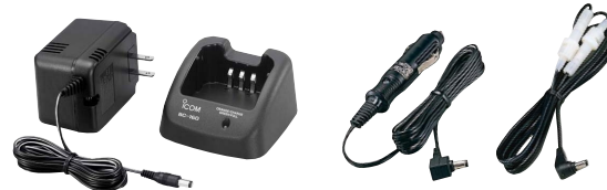
▲ BC-145 ▲ BC-160 ▲ CP-17L ▲ OPC-515L

BC-160 DESKTOP CHARGER + BC-145 AC ADAPTER Charges the BP-231 in 2 hours (approx.).