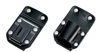
▲ MB-96N ▲ MB-96F

MB-96N : Swivel type belt hanger. Swivel joint of the MB-93 included.