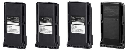
▲ BP-230 ▲ BP-231 ▲ BP-232 ▲ BP-240