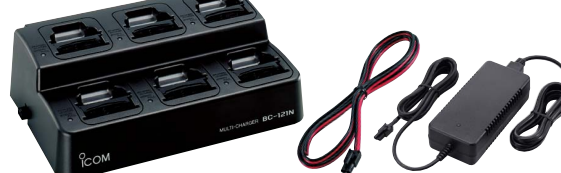
▲ BC-121N+AD-106 (6 pcs.) ▲ OPC-656 ▲ BC-157

BC-121N MULTI-CHARGER + AD-106 CHARGER ADAPTER + BC-157 AC ADAPTER (Six AD-106s are required)