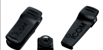
▲ MB-93 ▲ MB-94

MB-93 : Swivel type. A fast and easy way to remove the transceiver from your belt.